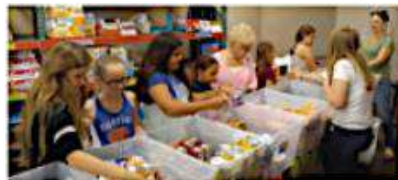
Local Girl Scouts recently pitched in to help pack weekend meals for St. Lucie County food-insecure students. ■

She said on average, Grace Packs is now giving more than 500, approaching 600 at times, meal packs to St. Lucie County students weekly.