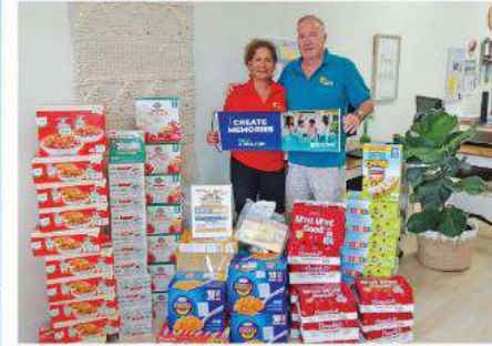
Community friends from Vic's Pichs Realty offered a wonderful food drive that helped us with our beginning of the year pantry needs.