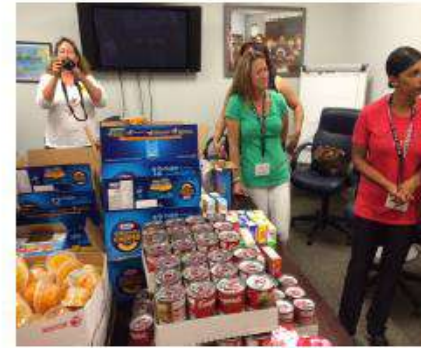
THERE WERE SEVERAL TEACHER VOLUNTEERS TO SORT AND BAG FOOD FOR STUDENTS TO BE PUT IN IN THEIR BACKPACKS ON FRIDAY AFTERNOON TO BRING HOME FOR A MEAL ON WEEKENDS