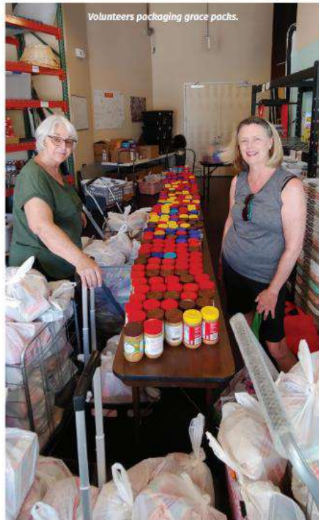
Volunteers packaging grace packs.

Other dedicated volunteers serve in the pantry, completing a host of jobs from checking in food, noting expiration dates, filling bins, and assembling hundreds of Packs weekly for hungry children.