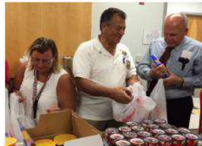
MANY STUDENTS GO HUNGRY ON WEEKENDS