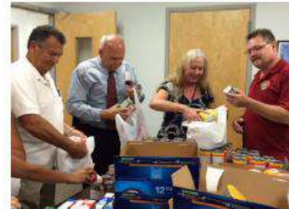
CHARITY IS THE FIRST PRINCIPLE OF THE KNIGHTS