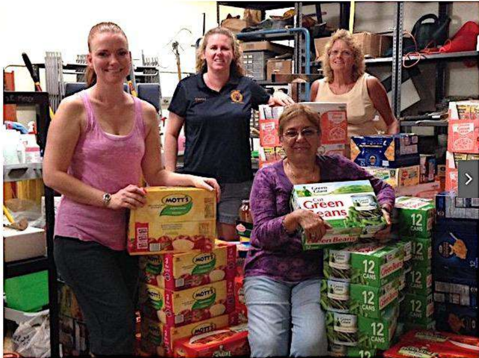
Copyright 2015 Journal Media Group. All rights reserved. This material may not be published, broadcast, rewritten, or redistributed.