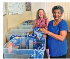
Grace Packs makes it possible for food insecure children to eat on the weekends, when school-provided meals are no longer available.