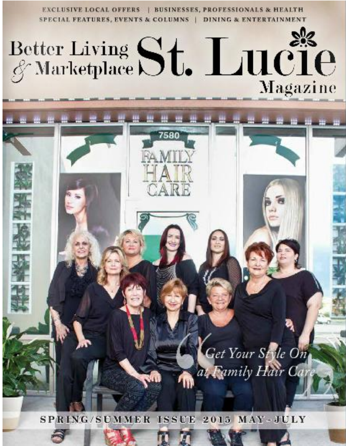
Better Living Marketplace St Lucie Magazine May '15-July '15 Issue

http://issuu.com/betterlivingmag/docs/blm_may_2015_web