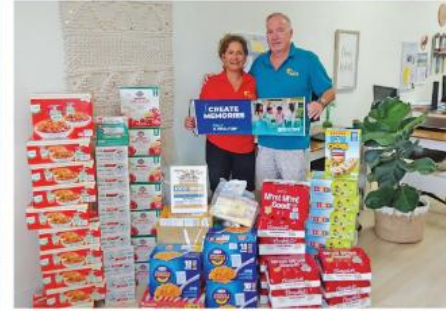
Community friends from Vic's Picks Realty offered a wonderful food drive that helped us with our beginning of the year pantry needs.