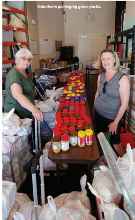
Volunteers packaging grace packs.

Other dedicated volunteers serve in the pantry, completing a host of jobs from checking in food, noting expiration dates, filling bins, and assembling hundreds of Packs weekly for hungry children.