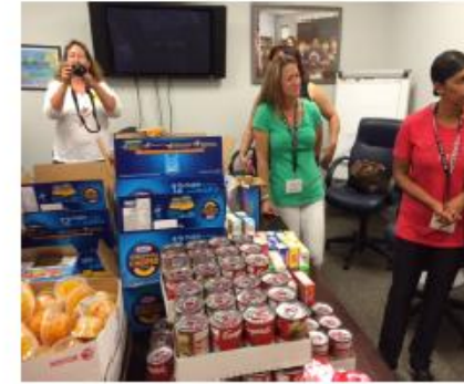
THERE WERE SEVERAL TEACHER VOLUNTEERS TO SORT AND BAG FOOD FOR STUDENTS TO BE PUT IN IN THEIR BACKPACKS ON FRIDAY AFTERNOON TO BRING HOME FOR A MEAL ON WEEKENDS