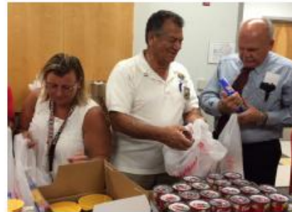
MANY STUDENTS GO HUNGRY ON WEEKENDS