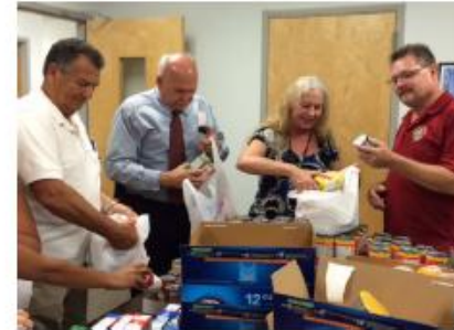
CHARITY IS THE FIRST PRINCIPLE OF THE KNIGHTS