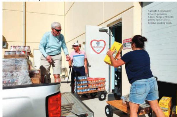
Sunlight Community Church provides Grace Packs with both pantry space and a helpful loading dock.